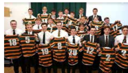
St Benedict's School 1st XV Squad 2017-2018