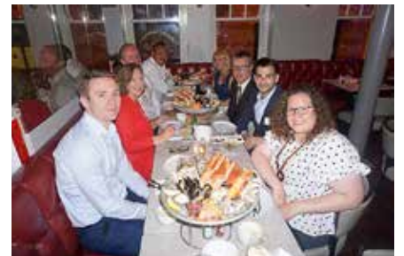
The work is done - let's eat!