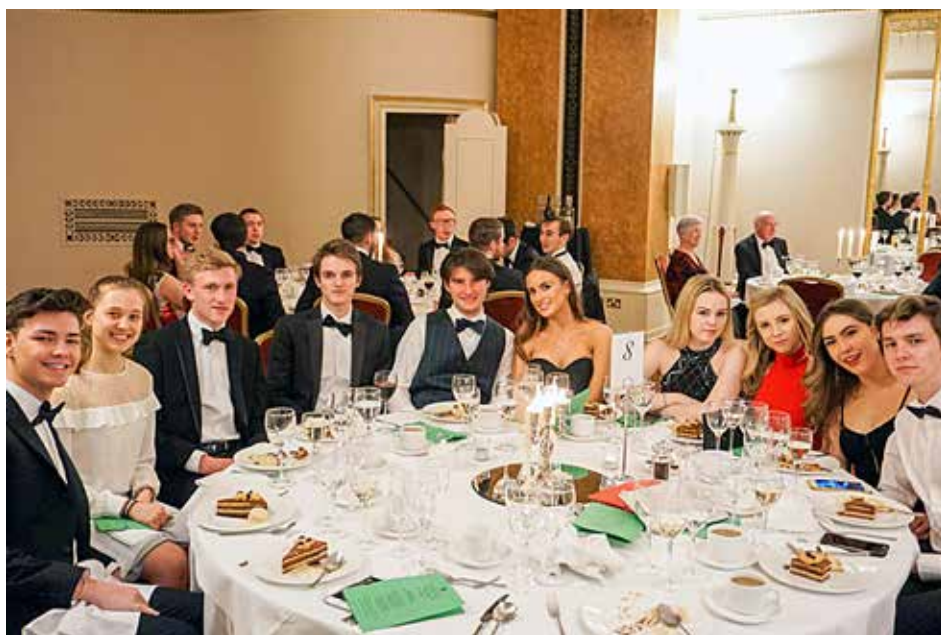
The table of 2017 Old Priorians and the current School Officials