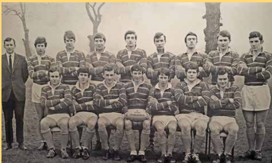
The Rugby Team (1968)