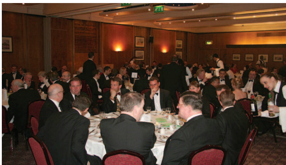
... and many others

three good men whom I was also delighted to see, who have been much tested in recent times and who have overcome difficulties with courage and grace.