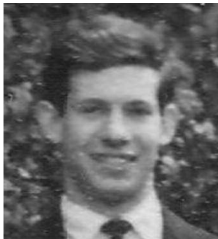
The Flower leaves St Benedict's (1960)