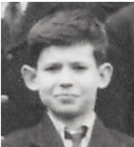
A little Flower in the Junior School (1952)