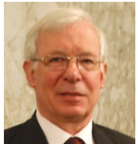
The fully bloomed Flower