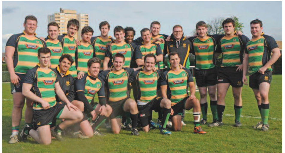
OPRFC Squad 2012