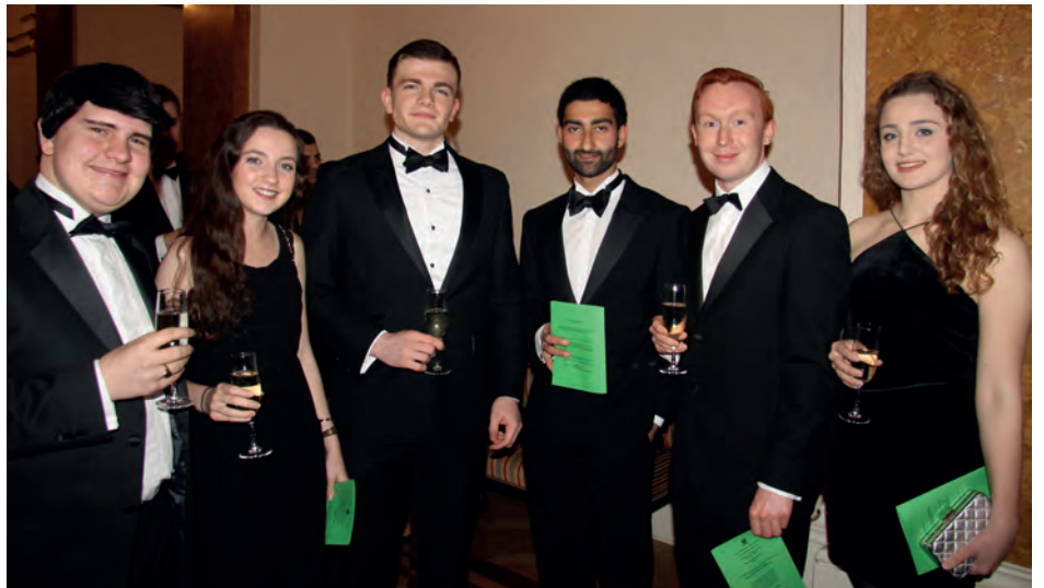
The Younger Generation

After that night, I would love to be able to take part in more OP events such as this; it was a wonderful and unique event which anyone would be lucky to attend. I truly