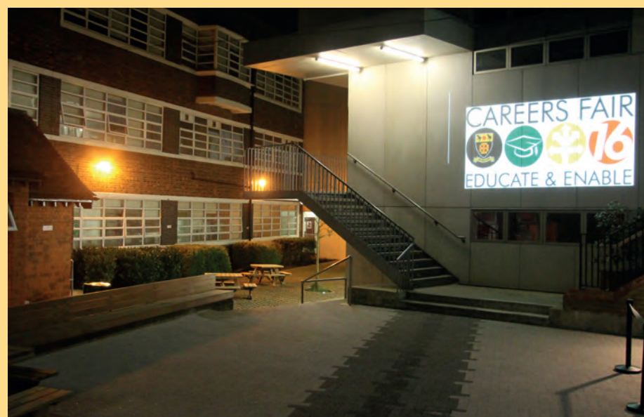
We're here ...

Current pupil: "The talks, atmosphere and excitement were great! It was really good and the highlight of my year so far".