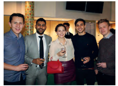
... and others