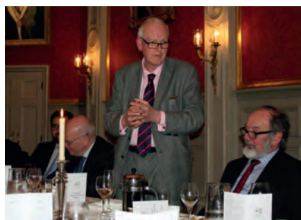
Guest of Honour, Lord Hennessy of Nympsfield

With a career in journalism spanning over four decades, Lord Hennessy's insight into British government and politics is unparalleled. He shared stories from his fascinating career as well as his thoughts on constitutional