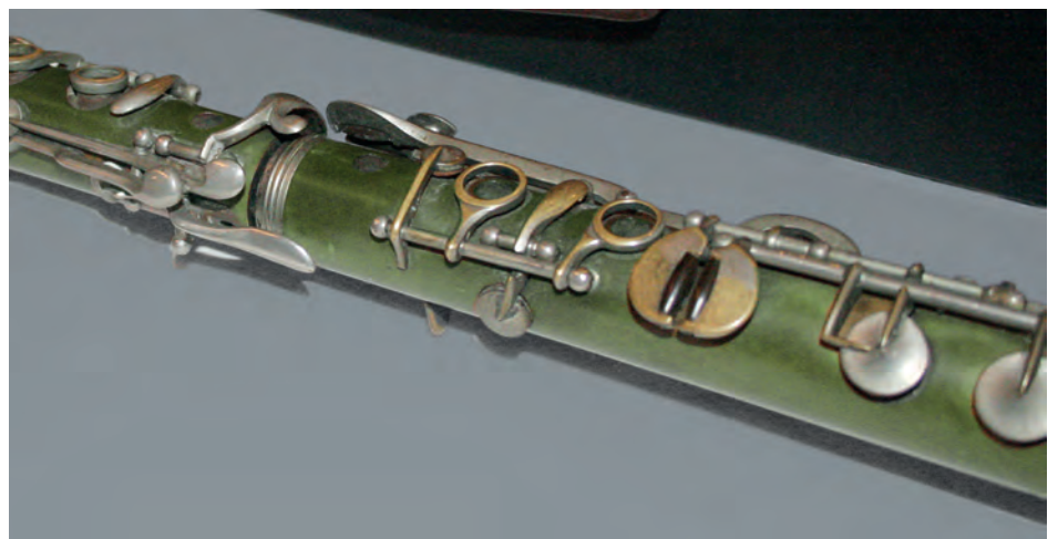
The clarinet as it looked in 1954