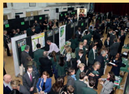
Orchard Hall Advice