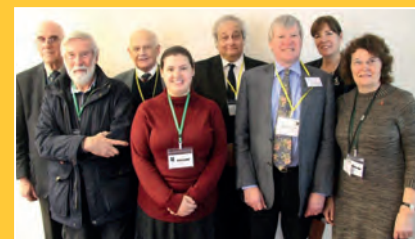
The AROPS gathering at St Benedict's