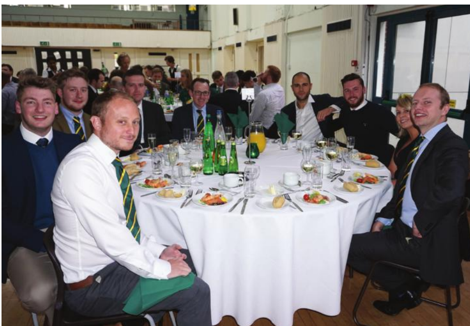
The OPRFC Table at the Annual School Rugby Dinner

Off the field, the Club continues to strengthen its ties with the School and this season was a first with not only the Head and the Exec team coming to both lunch