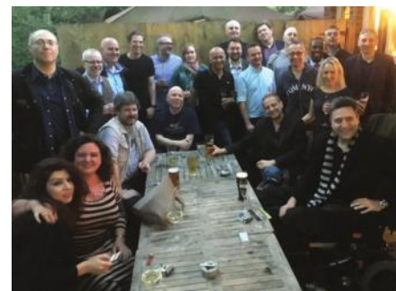
The OP 1987 Reunion