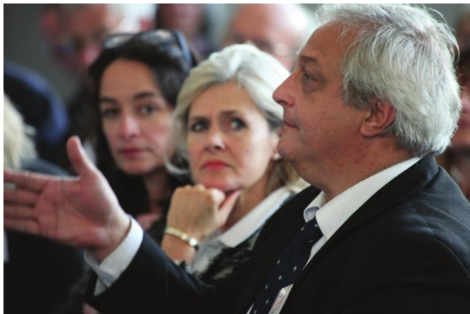
The President, "on duty" as the OPA AROPS Representative