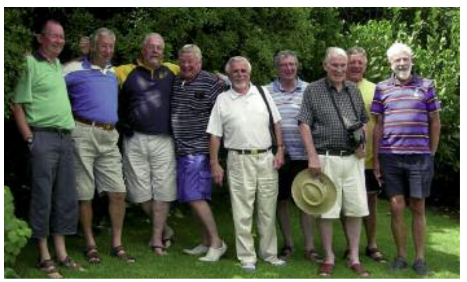
Only the Old Boys!