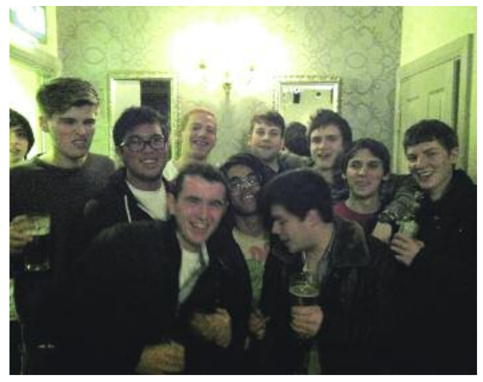
Fortified for the snow!

By virtue of the generous subsidy, the first forty-two entrants were given a coupon for a free drink and this was certainly well received. With everybody out of the Drayton by 11.30pm, decisions needed to be made about the subsequent events. Some went home due to the weather conditions and "whatnot" but the rest of us ventured to