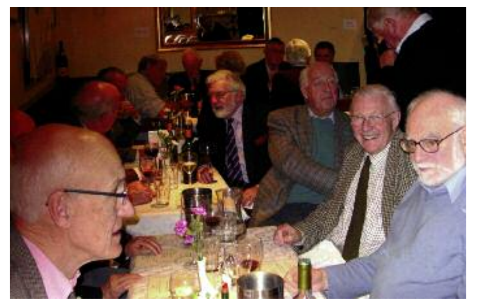
Most of the 21 present