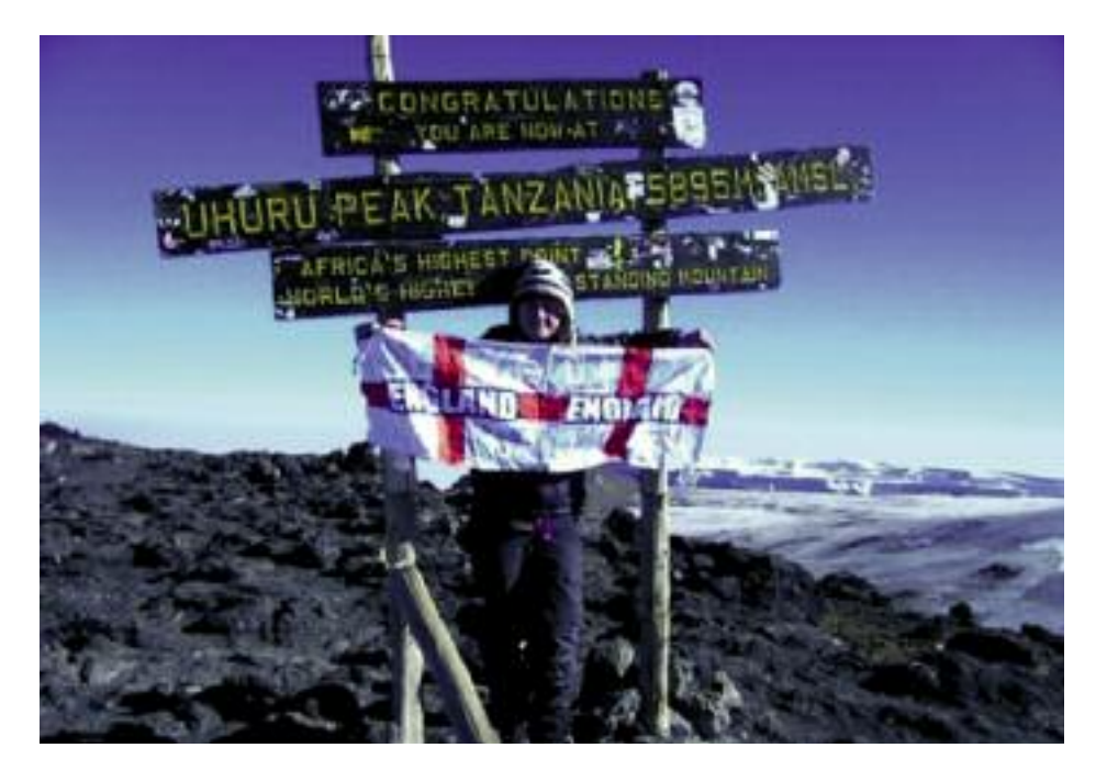
At the summit of Mt Kilimanjaro

work we completed here for a local village has already brought about positive and sustainable change to these people's lives. It has enabled them to distribute grants from NGOs to those suffering from HIV or AIDS in the more rural regions, these grants will support and kick start local businesses to provide these people with a livelihood. Without the brand new offices that we built, such opportunities in life would not have been possible for these local villagers.